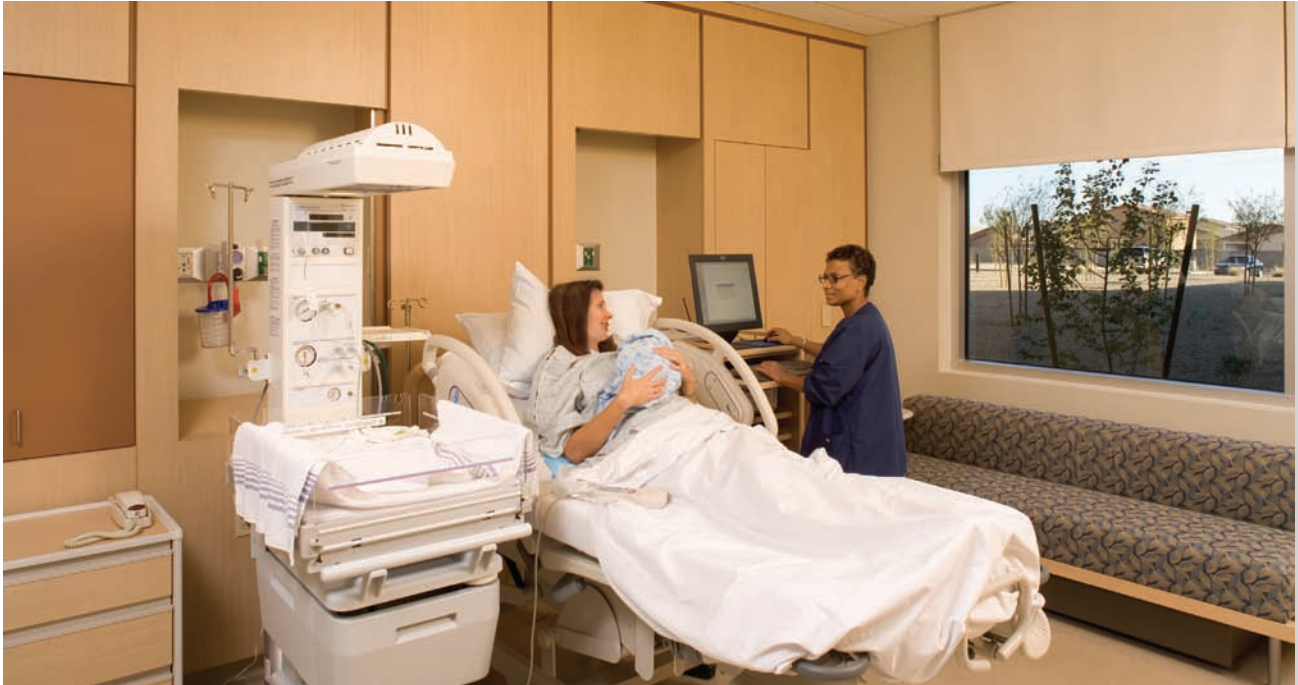
Children's room. Newborn Intensive Care Unit (NICU), Children's Medical Center of Dayton, Ohio. E. Lynn App Architects, Inc.