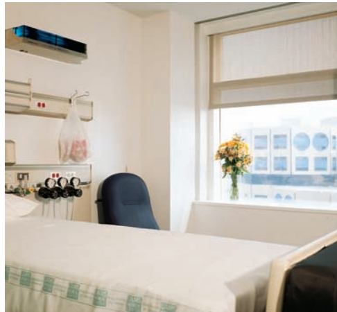
Patient room. University of Arkansas Medical Science. Stuck/Mott Group, architects.