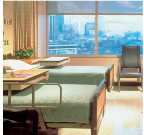
Patient room. Massachusetts General Hospital. Hancock & Hancock, architects.