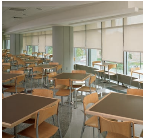
Dining facility. Duchossois Center for Advanced Medicine, University of Chicago. OWP/P, architects.

Contact MechoShade Systems, Inc., for complete warranty parameters.