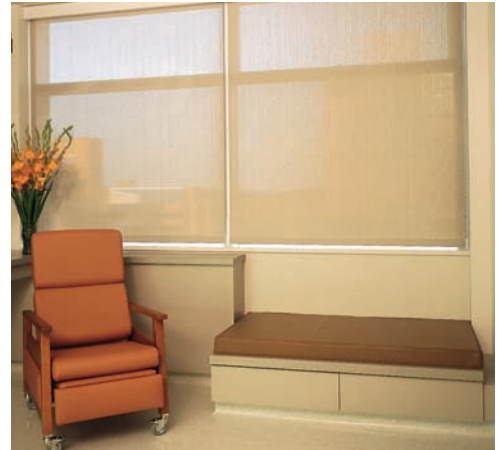
Patient room. University of Arkansas Medical Science. Stuck/Mott Group, architects.